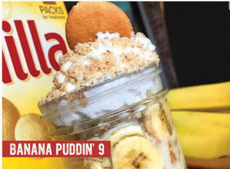
BANANA PUDDIN' 9