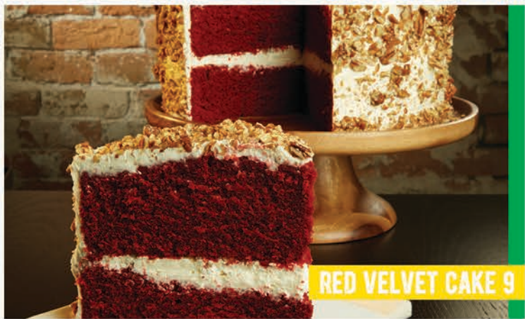
RED VELVET CAKE 9